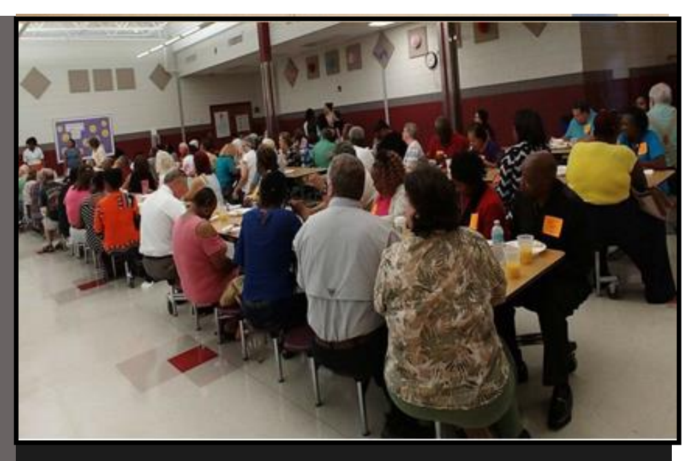
Parents receiving valuable information at a school's parent night

Additionally, the Federal Programs department will provide training to principals so principals will understand parent and family engagement requirements and plan opportunities for family engagement activities and meetings for the remainder of the school year.